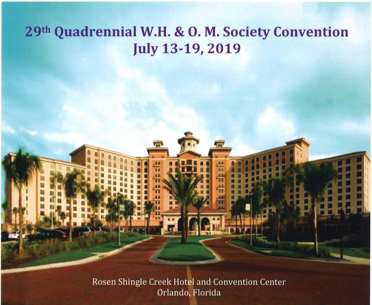
Rosen Shingle Creek Hotel and Convention Center Orlando, Florida

29 th Quadrennial W.H. & O. M. Society Convention July 13-19, 2019